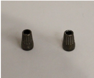
Most Unusual Cheryl Petenbrink