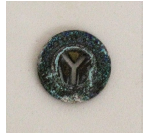
Best Relic Eric Figueroa